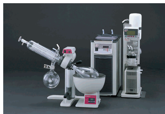
DTC-21 with Rotary Evaporator N-1001